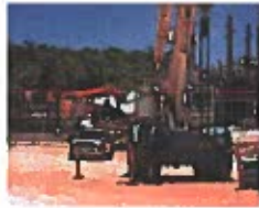
Contract personnel and heavy equipment can be seen as work continues along a roadway, just past the turnoff to the Guam National Wildlife Refuge, on March 31. The roadway is being installed near Ritidian Point to allow easier access to an area designated for several live-fire training ranges.