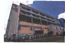
Guam Regional Medical City will team up with Shriners for a clinic.

Guam Regional Medical City will host a children's clinic with Shriners Hospitals for Children, Honolulu and the Guam Department of Public Health and Social Services, according to a news release.